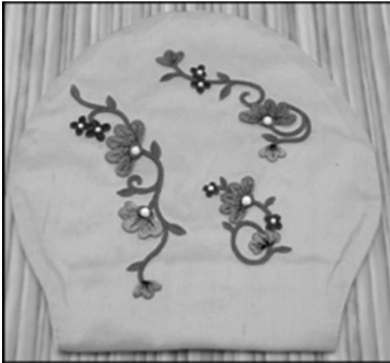
Pink satin with embroidered flowers and crystal embellishments

artisans using designer fabrics, decorative accents and specialty sewing techniques. The skin side is made with comfortable material that wicks away moisture and keeps your skin feeling cool and dry. The bottoms are fitted with Velcro for easy opening and closing. They custom fit your cover so it works with any system you're using. Amazingly, they are truly elegant! Look at this.