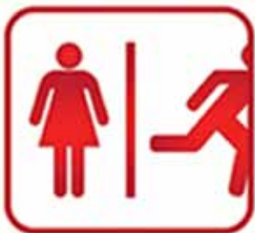
Ostom-i Alert Logo

As their website states, "The Ostom-i Alert sensor is a discrete innovative device that alerts ostomates as to how full their ostomy/stoma pouches are so that they can decide if and when to empty them. The device clips on to any ostomy pouch sending Bluetooth alerts to an app on your mobile device telling you that your pouch is filling up. You can set individual alerts as to when you wish to be notified. Each device is single use only and last up to three months."